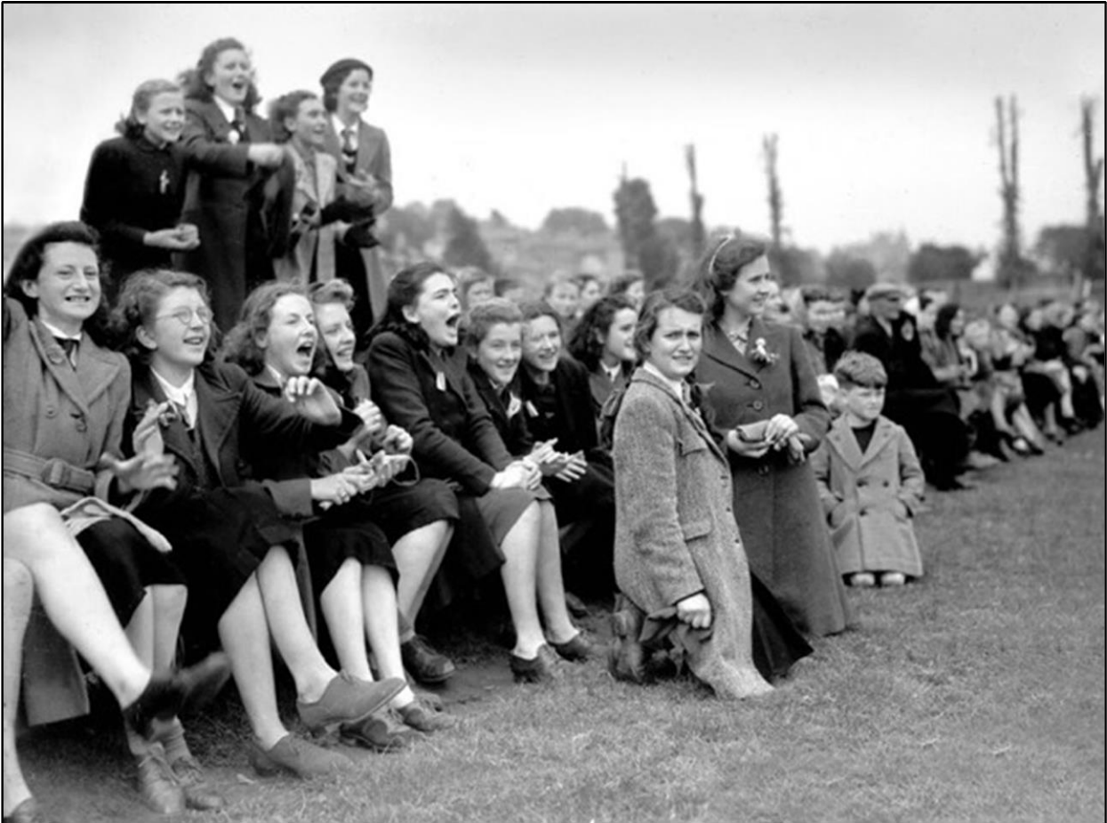
A section of the attendance at the school final of 1946 at the Mardyke.